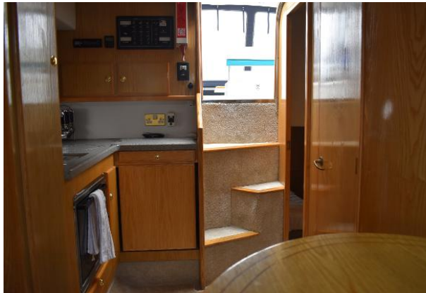
Saloon Looking Aft