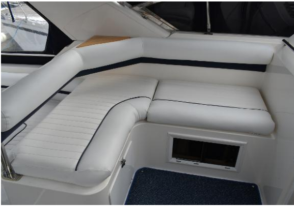
Mid Cockpit Seating