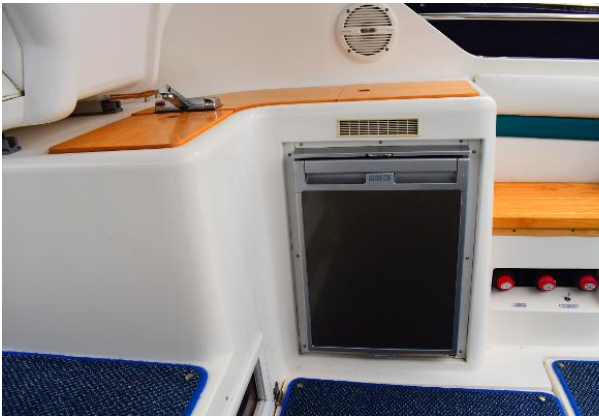
Cockpit Bar & Fridge