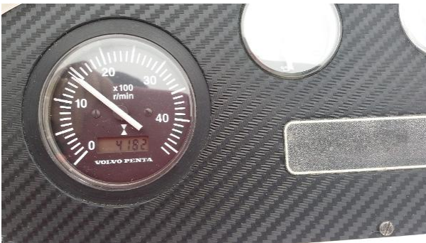
418 Engine Hours (09.07.2017)