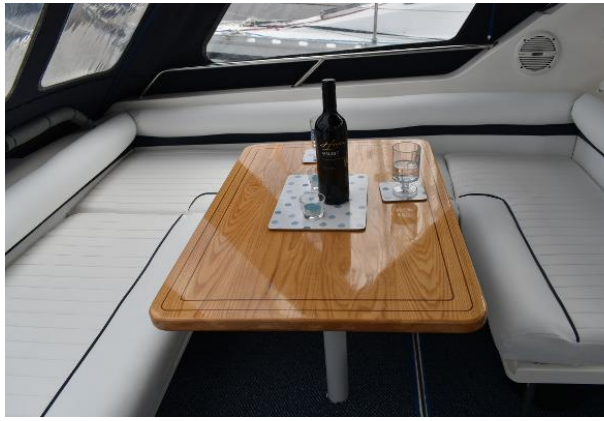
Aft Cockpit Seating