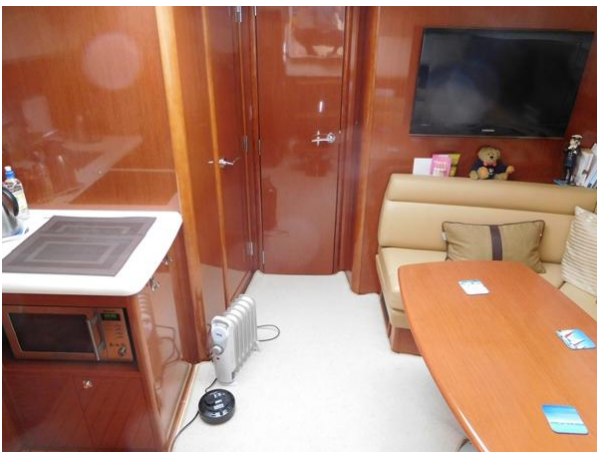
Saloon looking forward