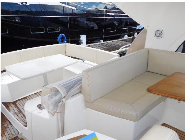
Looking aft to aft seating area