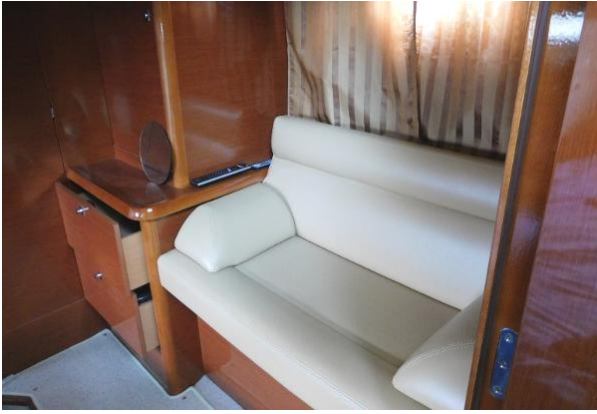
Aft cabin seating