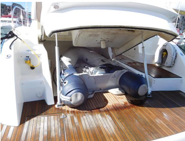
Aft Tender Garage