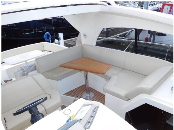
Looking in through sunroof