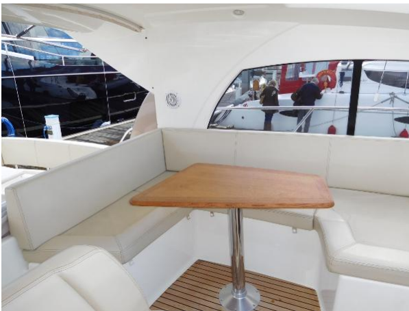
Seating opposite helm position