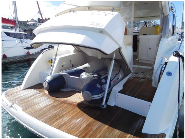
Aft Tender Garage