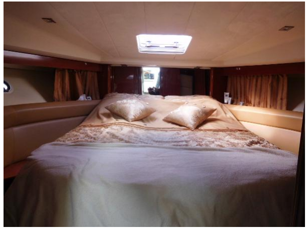
Forward Master Cabin