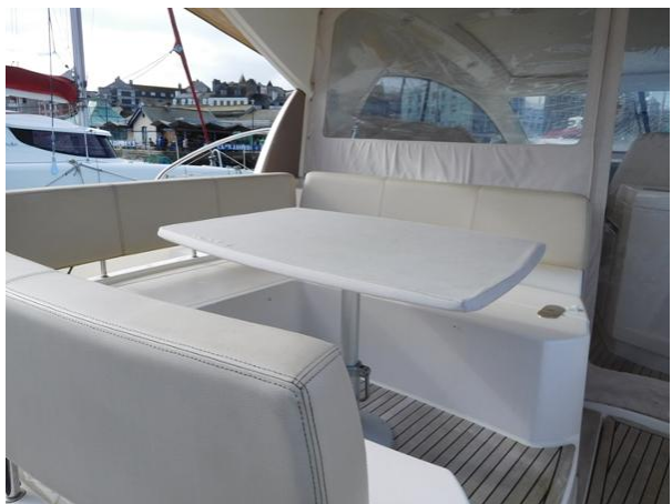
Cockpit - Aft seating area