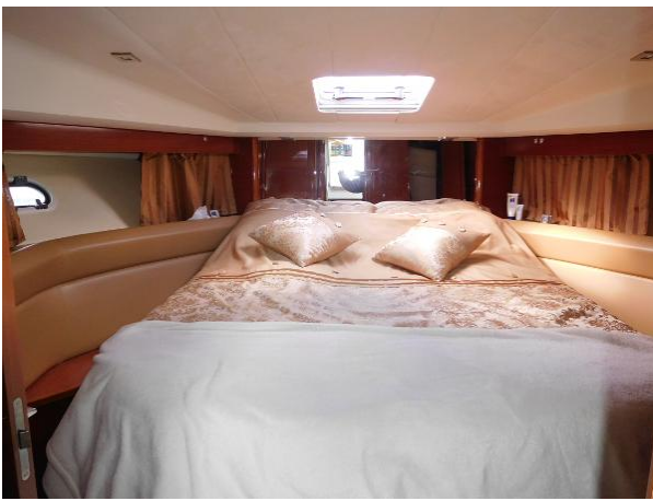
Forward Master Cabin