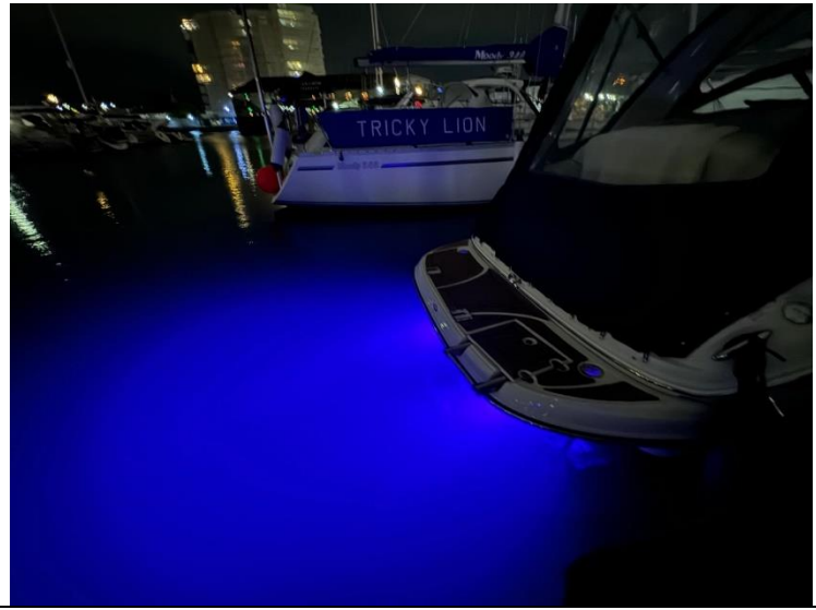
Cool underwater lights!