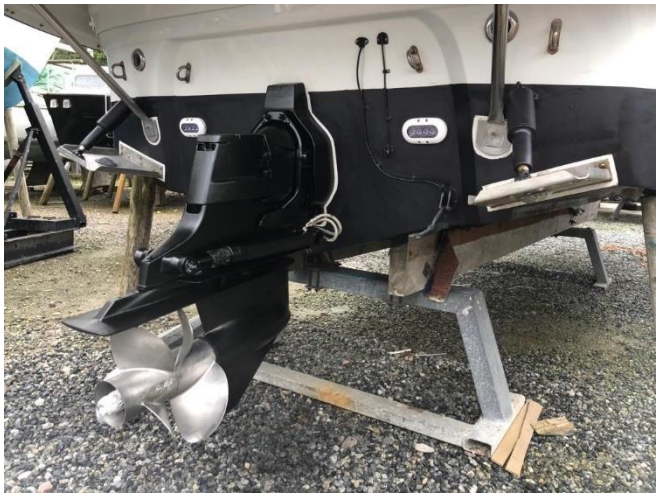
Transom & drive with new transom shield