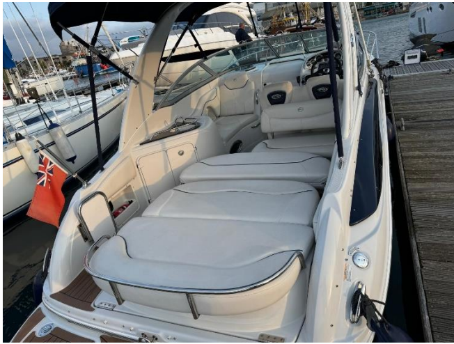
Cockpit area & aft sunpad