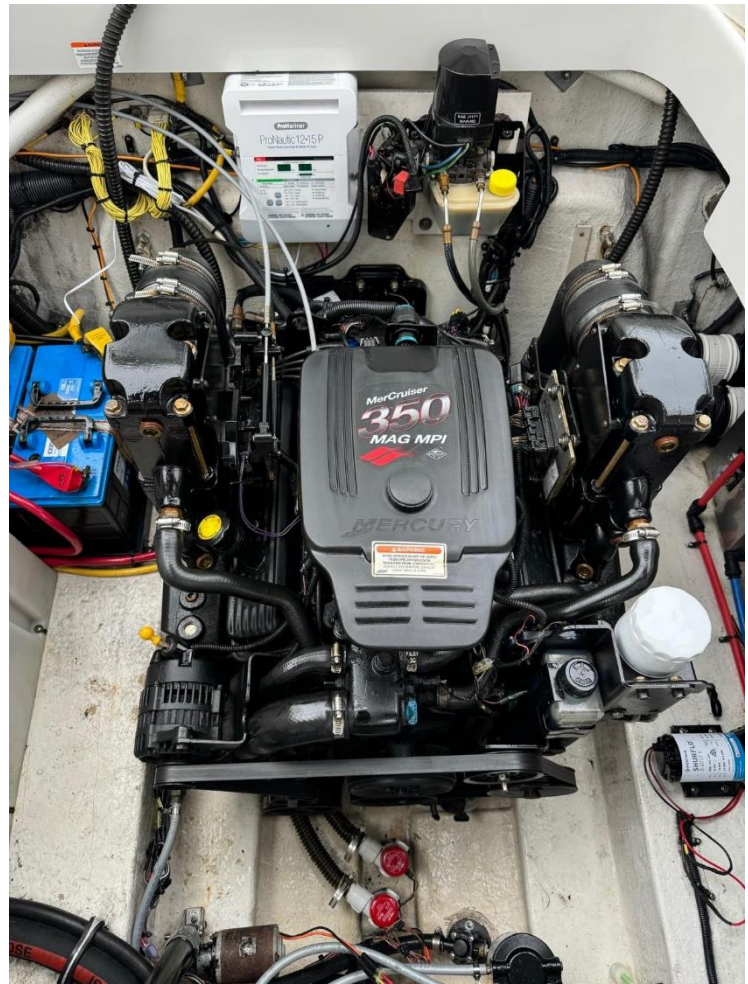
Fully rebuilt Mercruiser 350Mag V8 Engine