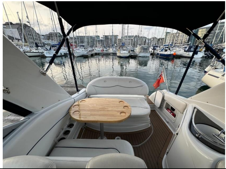
Cockpit looking aft