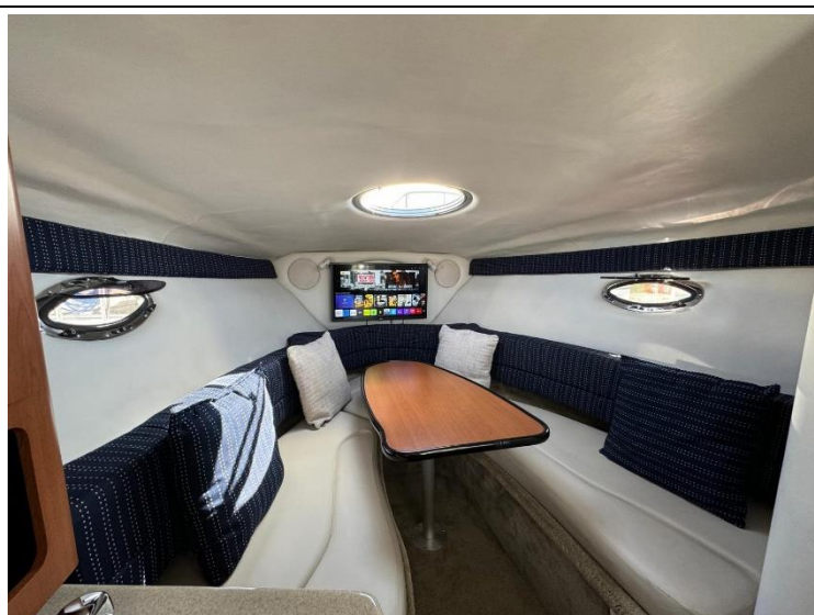
Saloon seating forward