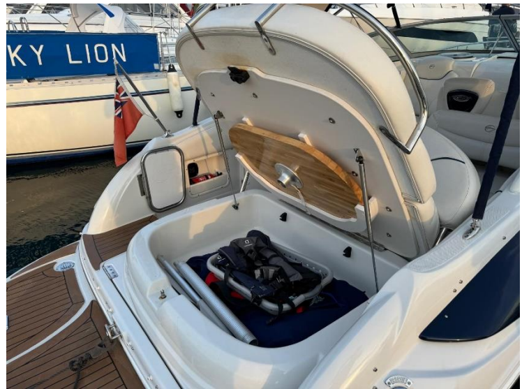
Cockpit storage aft

Barbican Yacht Agency Sutton Harbour Marina, Plymouth Devon Tel: +44 (0)1752 228855 info@plymouthyachts.com http://www.plymouthyachts.com