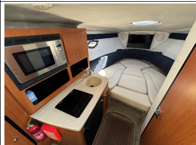
Galley area & forward double berth