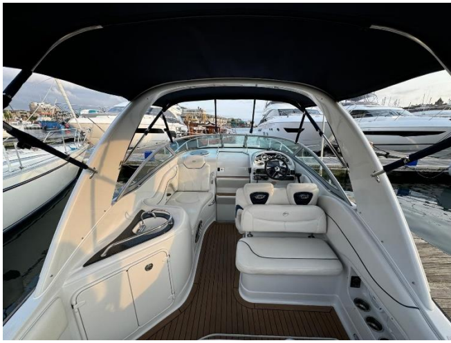
Cockpit looking forward