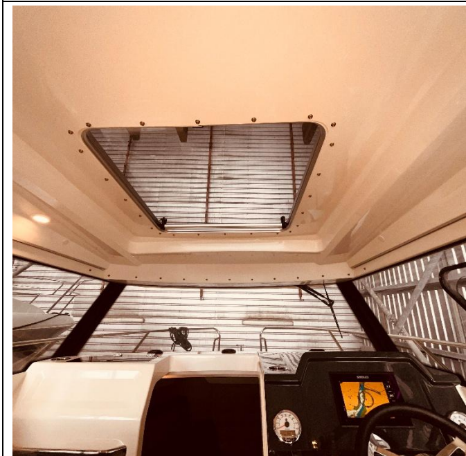
Pilothouse roof hatch