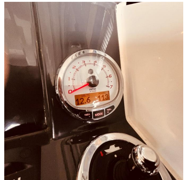
Helm area detail