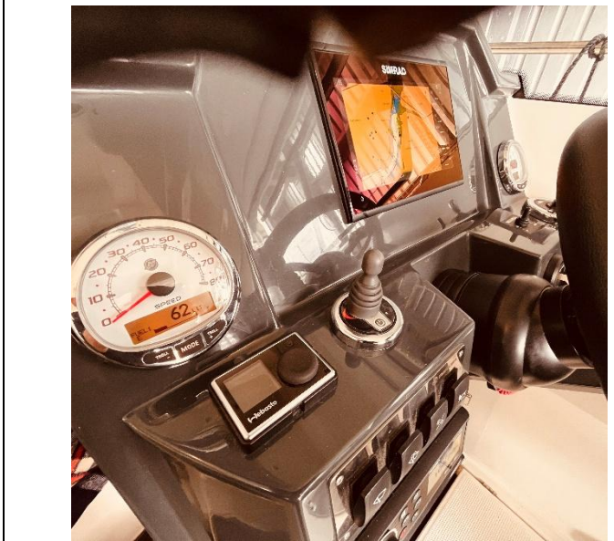
Helm area detail