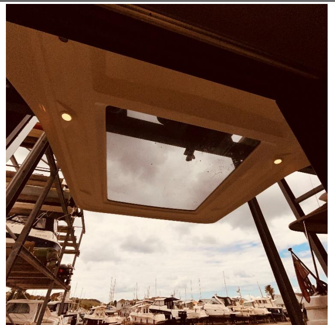
Extended roof over cockpit