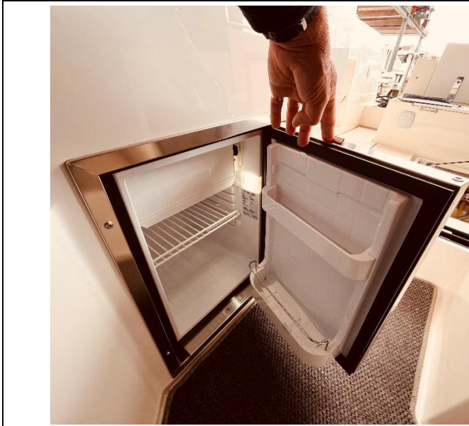
12v Front opening fridge