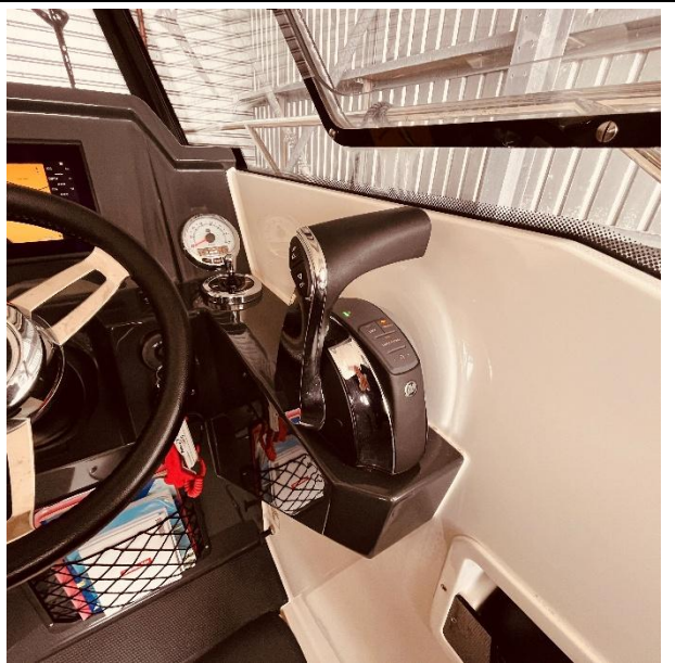
Helm area detail