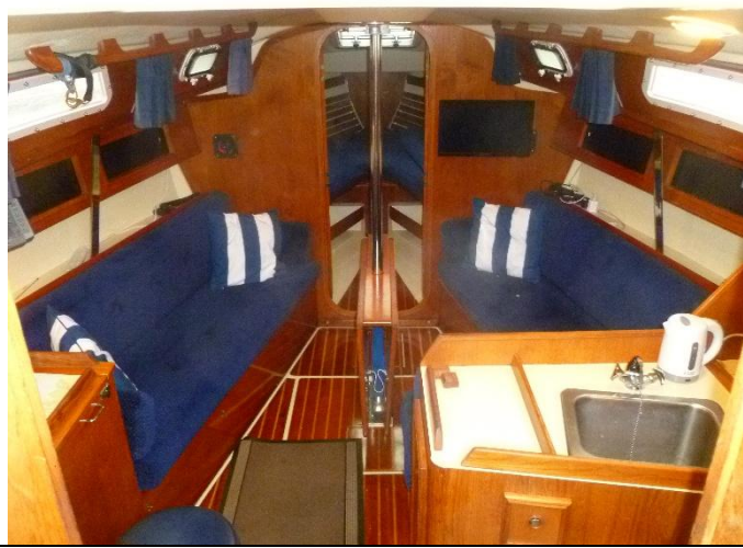
Saloon looking forward