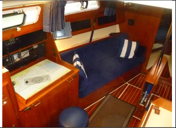
Nav area & port side