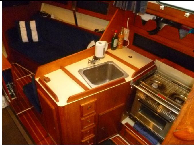
Galley area & starboard side