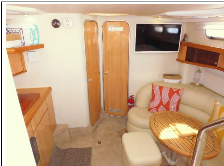
Saloon looking forward