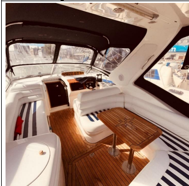
Cockpit looking forward