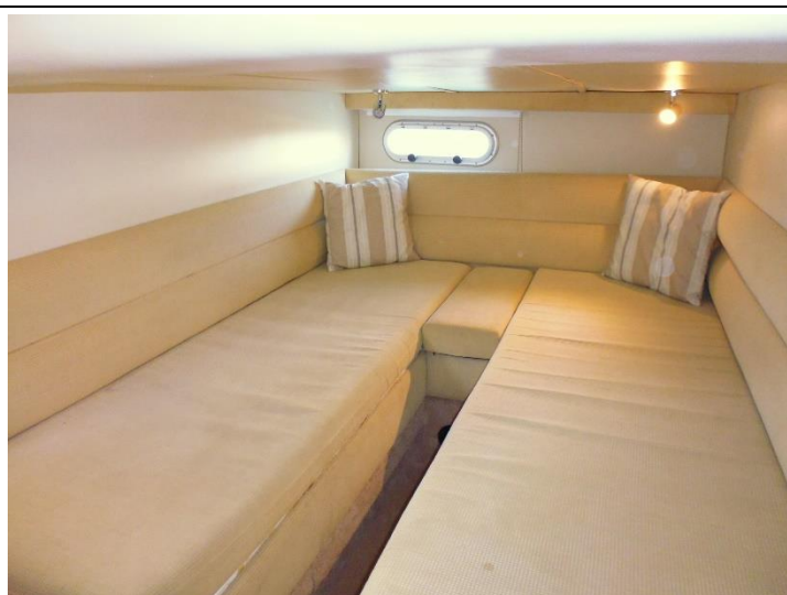
Aft guest cabin