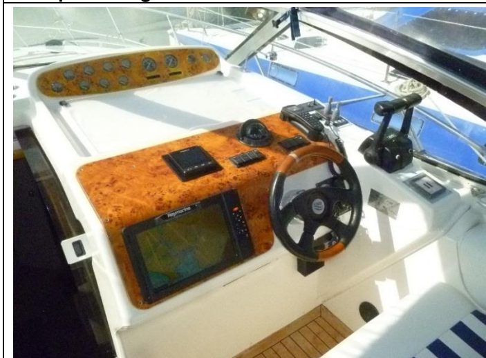
Helm position, new plotter etc