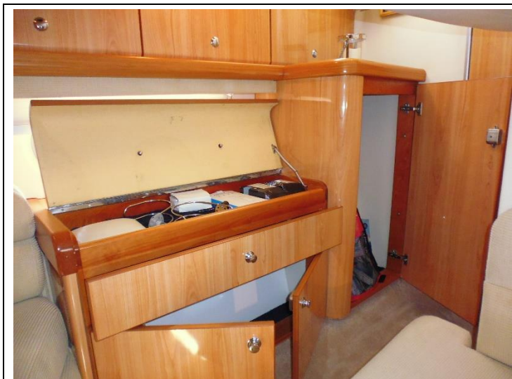
Aft cabin storage