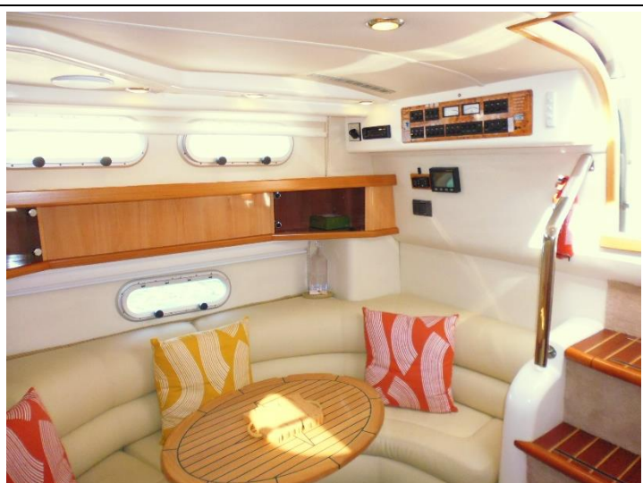
Saloon looking aft